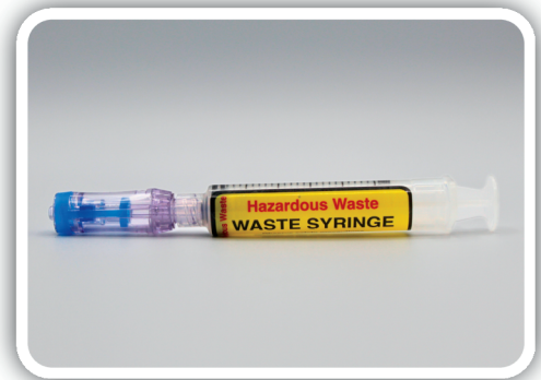
5 mL Hazardous Waste Syringe with ICU Medical Spinning Spiros