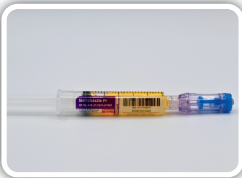
Methotrexate 5 mL Syringe with ICU Medical Spinning Spiros

The STAQ Pharma Methotrexate CSTD Kit combines our ready-to-administer methotrexate with the ICU Medical closed system components to aid in safety and consistency for hazardous drug preparation. This kit helps minimize exposure risk, streamline workflow with ready-to-use components, and ensure safe delivery for both staff and patients — all in one convenient package that eliminates the need to source components separately.